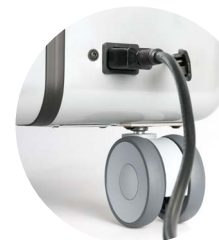
central power supply with protective cap