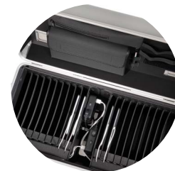
20x pockets for Tablets