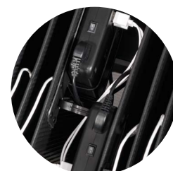
2x MC10 Multi-Charger provides power for all devices